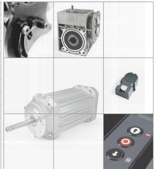
Table of components